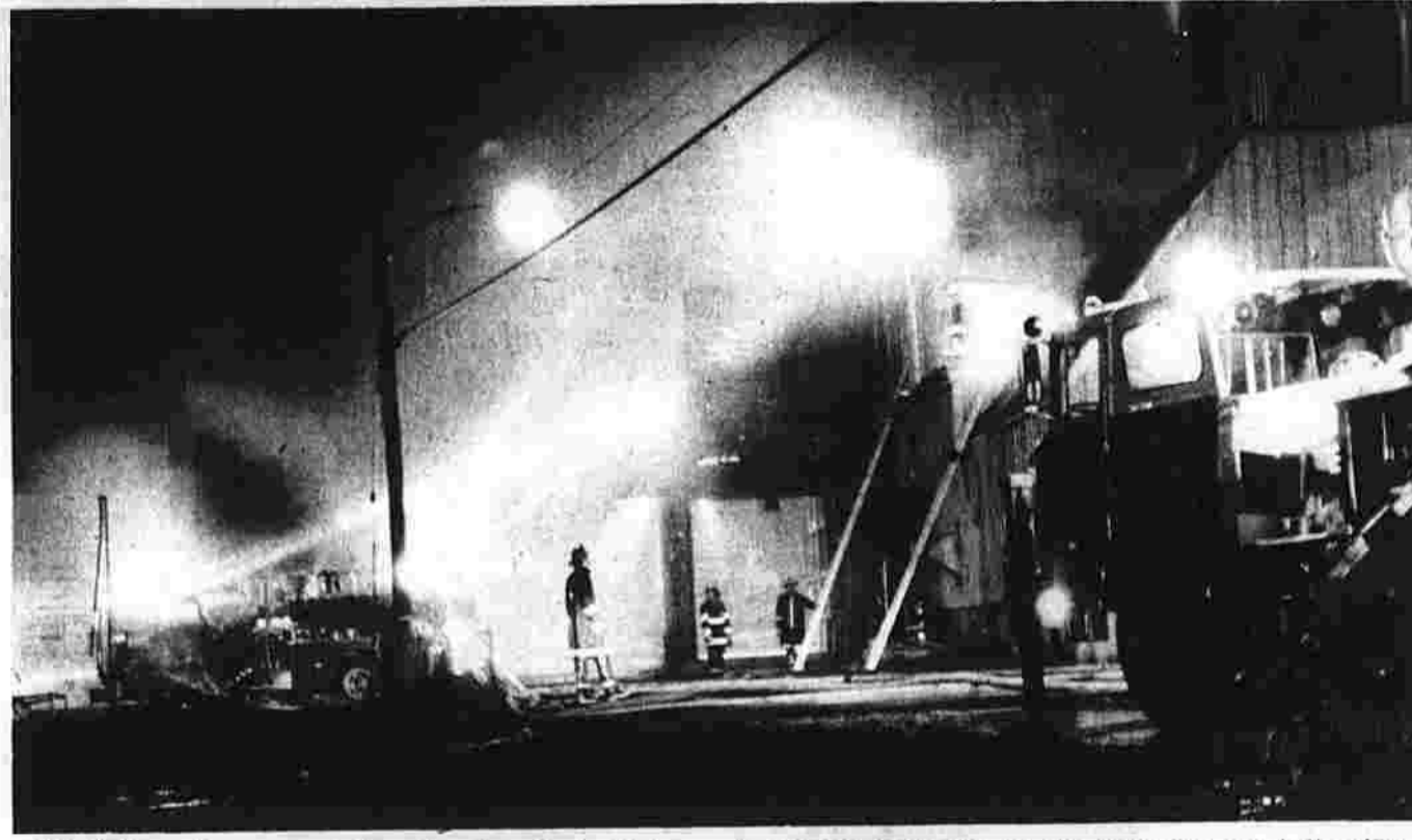
Firefighters from seven fire departments battled a "suspicious" three-alarm fire late Saturday night at the Central Connecticut Farmers Cooperative, Manchester. The fire is under investigation by the state fire marshal's office.

Vol. XCIX, No. 207 - Manchester, Conn., Monday, June 2, 1980 • Since 1881 • 20c