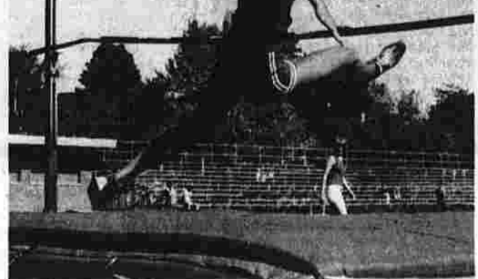
Up, up...but not over

Rummage sale set - MANCHESTER - There will be a rummage sale on Tuesday, from 9 a.m. to noon, in Cooper Hall of South United Methodist Church, 1228 Main St.